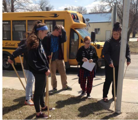
Geometry class using similar triangles to find the height of the flagpole