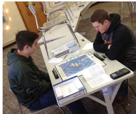
Two Seniors playing the game Equate