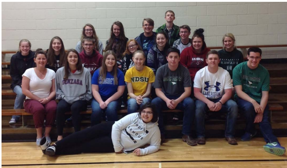
Thank you Edmore school and Community for a great year!