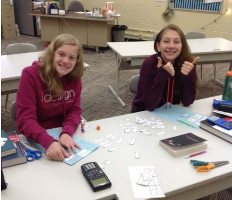
The Freshmen putting together a factoring puzzle