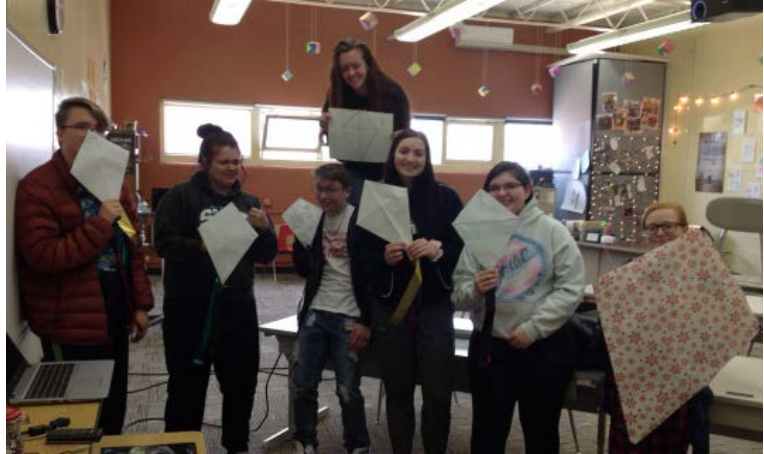
Geometry class with their mathematical kites: